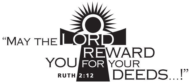
DEEDS_1935 (NRSV) Ⓞ DEEDS_1935C (NRSV) DEEDS_1935NIV (NIV) Ⓞ DEEDS_1935NIVC (NIV)