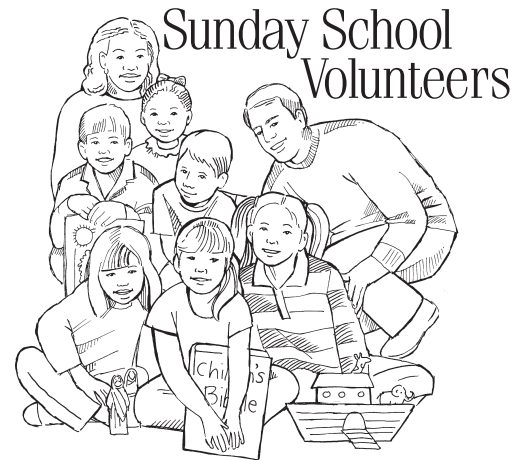
KIDS_1924 Ⓞ KIDS_1924C