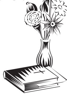
FLOWERS_1949 Ⓞ FLOWERS_1949C