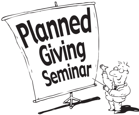
SEMINAR_1960 Ⓞ SEMINAR_1960C