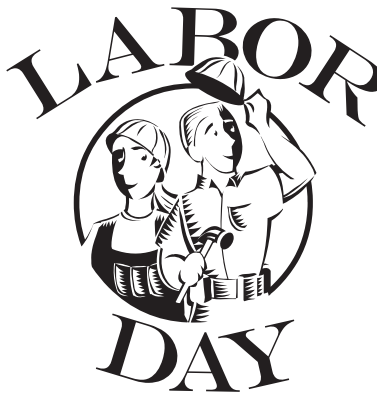
LABOR_1950 Ⓞ LABOR_1950C