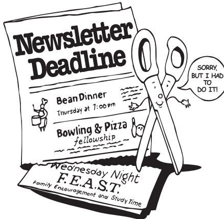
NEWS_1962 Ⓞ NEWS_1962C